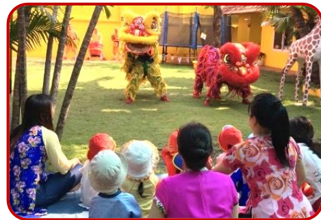
We took a picture with the lions and dragon!!!