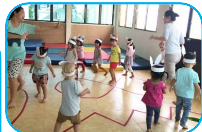
We loved to move like bunnies to the song "This is the way the Bunny hops"

In March, we enjoyed talking and exploring Easter, dancing to bunny songs and hunting for our Easter eggs!!